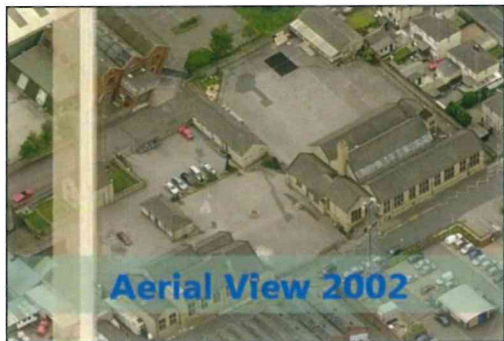
Aerial View 2002

Allah swt says: The likeness of those who spend their wealth in the path of Allah, is as the likeness of a grain, it grows 7 ears, and each ear has a hundred grains. Allah gives manifold increase to whom he wills. And Allah is All Sufficient for his creations needs, All Knower. (Al Baqarah)